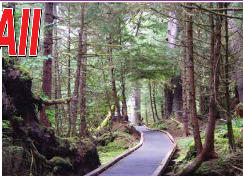
Tow Hill walking trail.