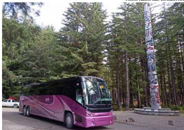
The Solstice Pole, Hiellen.

before continuing to Prince Rupert, the gateway to BC’s beautiful north coast. Settle in at the friendly Inn on the Harbour .