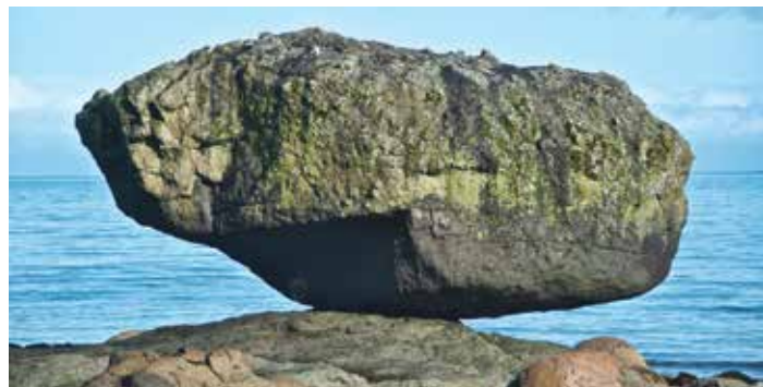
Balance Rock at Skidegate.