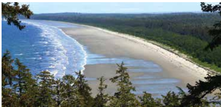
Haida Gwaii beach.