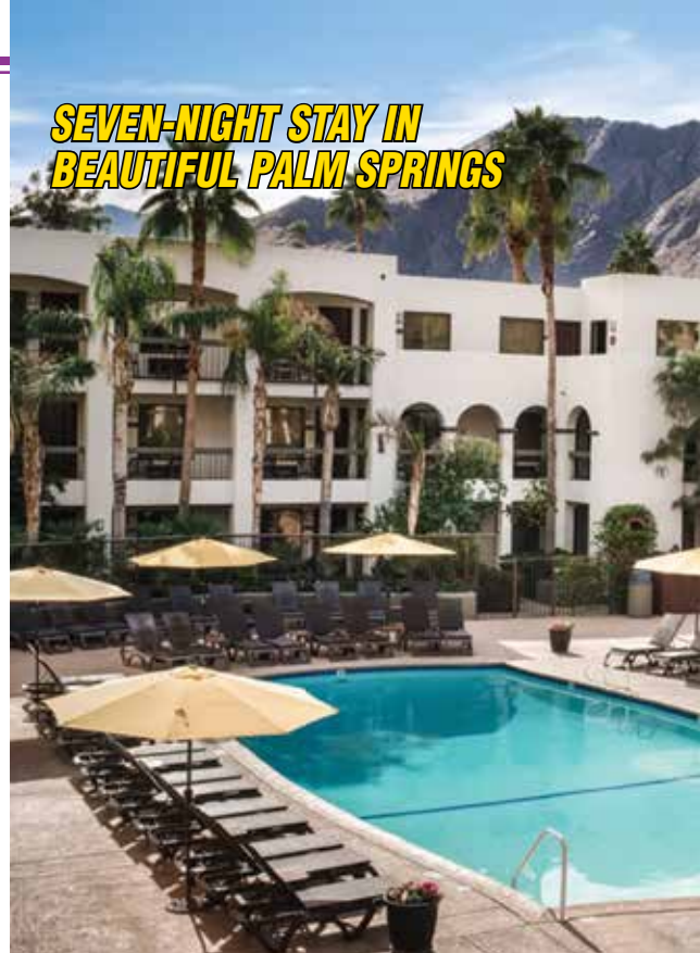
Palm Mountain Resort, Palm Springs.

SEVEN-NIGHT STAY IN BEAUTIFUL PALM SPRINGS