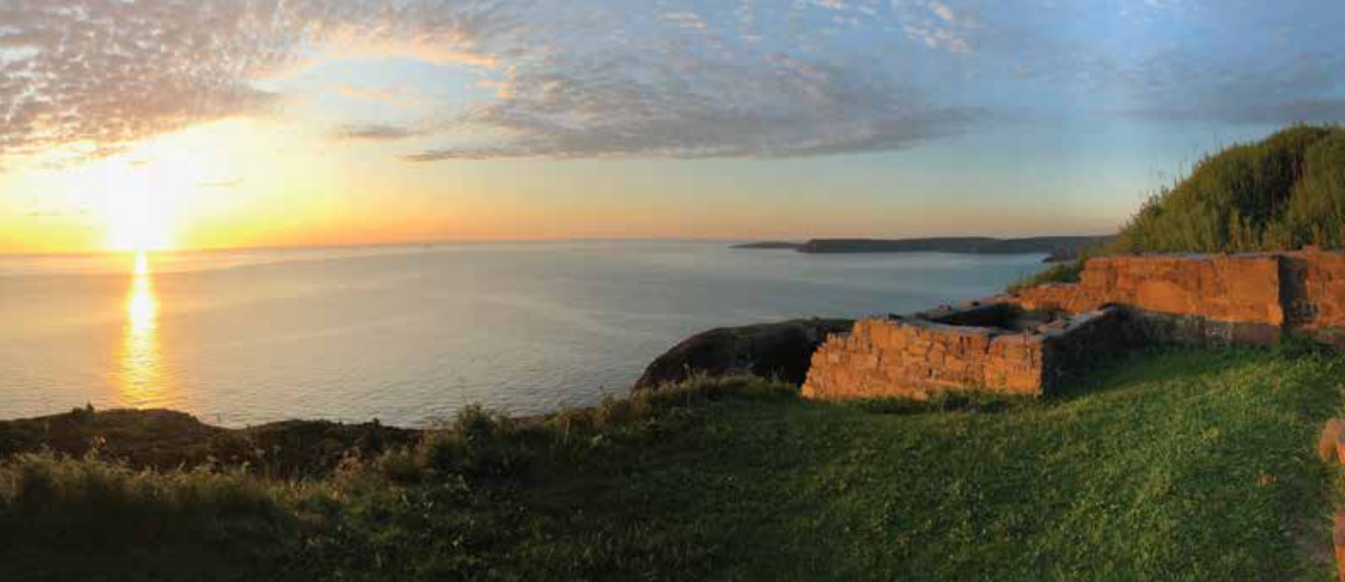
Sunrise at Signal Hill.