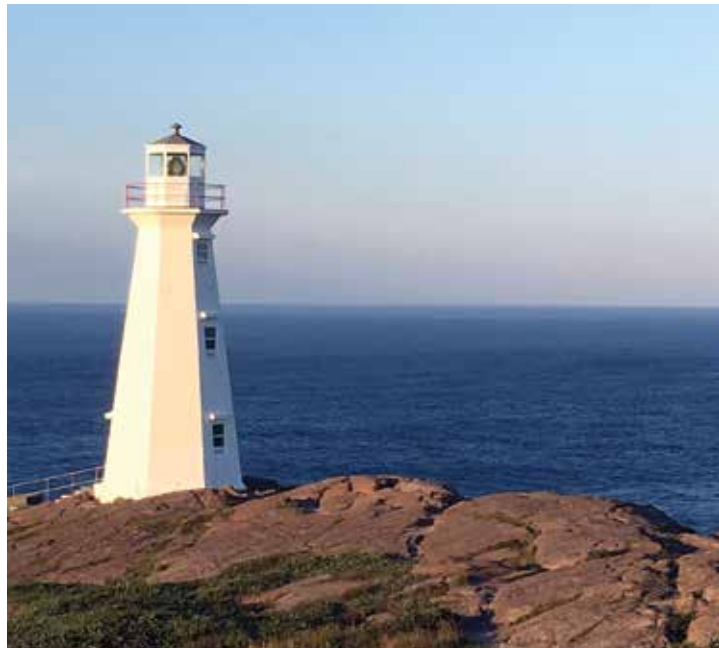
Cape Spear National Historic Park.

8 ST. JOHN’S to HOME CITIES: All good things must come to an end and so we bid a fond farewell to our newest yet oldest province. Fly home with many delightful memories of an authentic Newfoundland experience to be recalled for years to come. AIRPORT TRANSFER is provided. Meals Include: Breakfast.