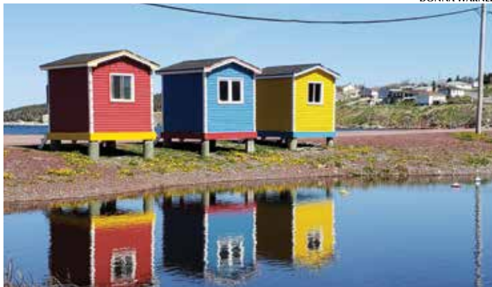
Fishing Stages Cavendish, Newfoundland/Labrador.