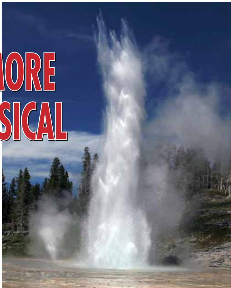
Grand Geyser and Vent Geyser in Yellowstone National Park.