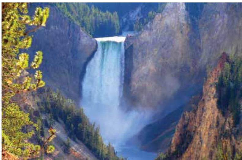
Grand Canyon Falls, Yellowstone National Park.

6 DEADWOOD to BLACK HILLS to SPEARFISH: Thursday. This morning travel through the BLACK HILLS NATIONAL FOREST to visit two of the world's largest mountain carvings. Ride the Black Hills Central Railroad 1880 TRAIN, an authentically restored steam engine that transports you back in time, on your way to the MOUNT RUSHMORE NATIONAL MEMORIAL. Afterwards, travel by motorcoach to the CRAZY HORSE MEMORIAL and continue to Spearfish for overnight at the Fairfield Inn .