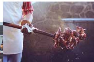
Medora Musical, Medora, North Dakota.