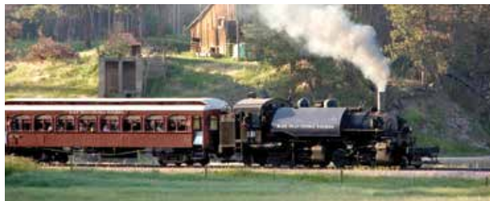
Ride the 1880 train.