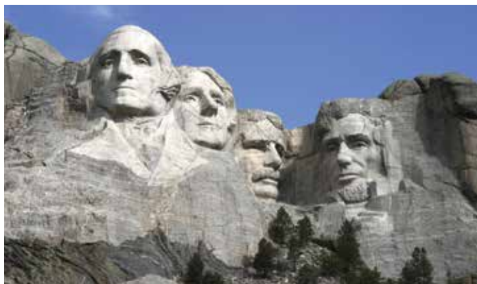
Mount Rushmore National Memorial.