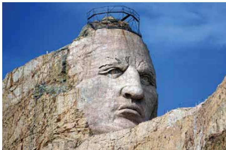
Crazy Horse Memorial.

6 DEADWOOD to BLACK HILLS to SPEARFISH: Thursday. This morning travel through the BLACK HILLS NATIONAL FOREST to visit two of the world's largest mountain carvings. Ride the Black Hills Central Railroad 1880 TRAIN, an authentically restored steam engine that transports you back in time, on your way to the MOUNT RUSHMORE NATIONAL MEMORIAL. Afterwards, travel by motorcoach to the CRAZY HORSE MEMORIAL and continue to Spearfish for overnight at the Fairfield Inn .