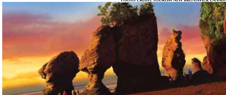
Hopewell Rocks, New Brunswick.

17 FREDERICTON to LEVIS: Wednesday. Before leaving the last Maritime province, venture across the HARTLAND COVERED BRIDGE, longest in the world. Visit SAINT-JEAN-PORT-JOLI to see the works of the