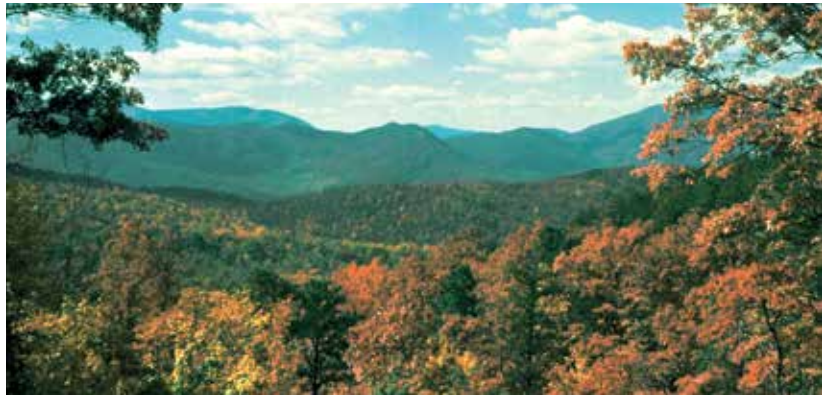
Autumn in the Smoky Mountains.

21 SWIFT CURRENT to CALGARY to EDMONTON: Tuesday . Today is "Going Home" day with many vivid memories of your music cities tour.