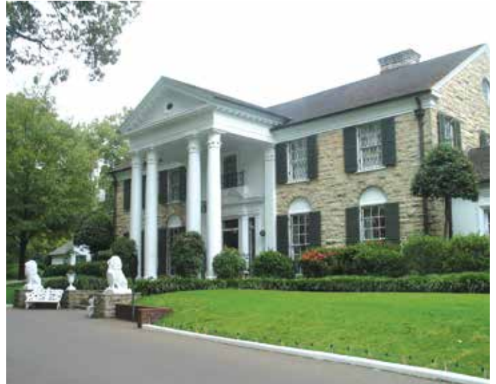
Graceland, Memphis, Tennessee.