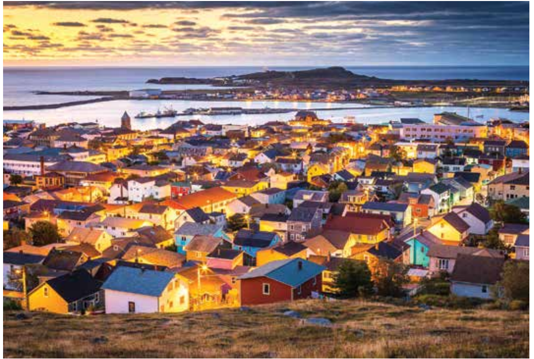
St. Pierre, France.