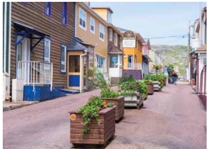
Downtown St. Pierre, France.

St. Pierre & Miquelon Official Currency: EURO symbol € Currency accepted: Canadian cash, debit and major credit cards at most businesses Cash transactions: change in Euros ATM: convenient to hotel