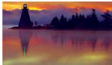
Baddeck, Nova Scotia.