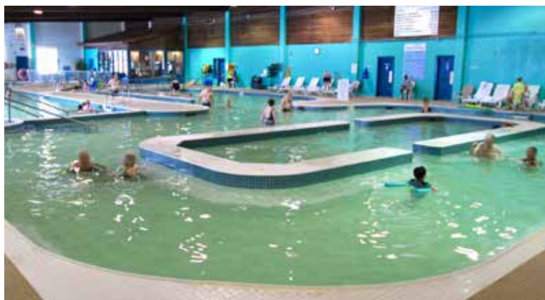
Manitou Springs Resort and Mineral Spa.