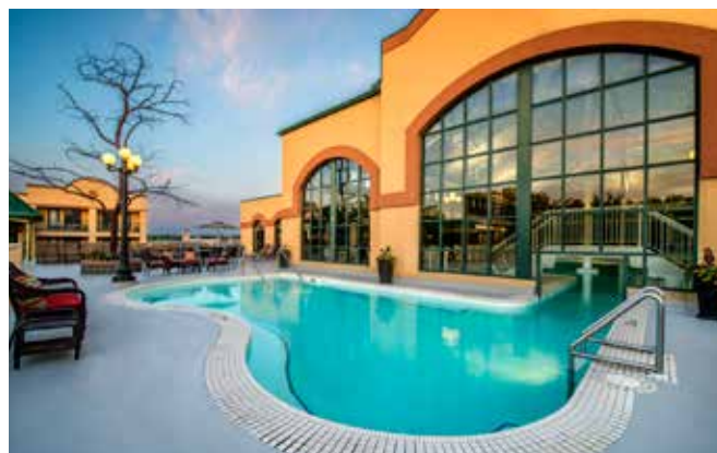
Temple Gardens Hotel and Spa.

DON'T FORGET YOUR SWIMSUIT! ROBES ARE PROVIDED AT BOTH SPAS. For more information on booking spa services, enquire at time of booking.