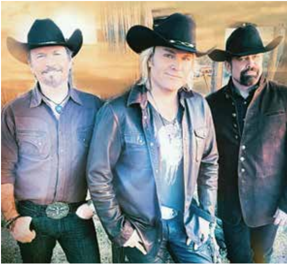
2022 Entertainers Texas Tenors.