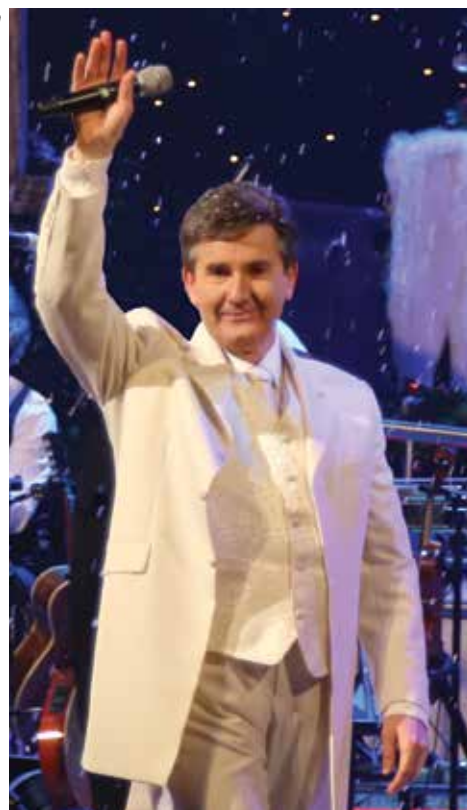
2023 Entertainer Daniel O'Donnell.

7 8 SWIFT CURRENT to CALGARY to EDMONTON: Monday. Return home with fond memories of your Høstfest experience and new friendships made.