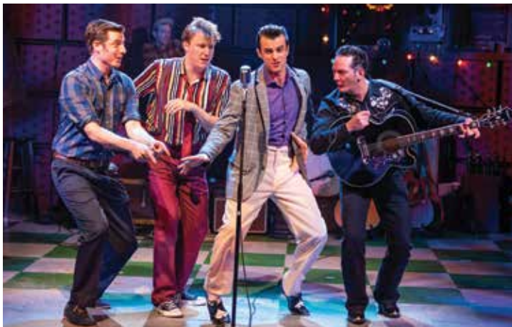
2023 Entertainers Million Dollar Quartet.

Excellent hotel attached to the Dakota Square Mall with DAILY TRANSPORTATION by motorcoach to/from Høstfest as well as daily shuttle tickets.