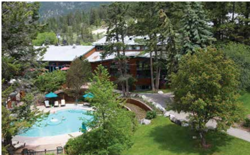
Private guest-only pool.

INCLUDED IN YOUR HOLIDAY: •First class transportation on an air-conditioned, washroom-equipped motorcoach •Three nights accommodation at Fairmont Hot Springs Resort •Services of an experienced Tour Director and Driver •Baggage handling, one average piece per person •Admission to attractions and sightseeing as outlined in the itinerary •Banff National Park •Kootenay National Park •Unlimited use of Fairmont Hot Springs 3 public pools •Access to resort guest-only Hot Springs Pool •Cranbrook •Casino of the Rockies •Farewell Dinner •1 Meal Includes: 1 Dinner.