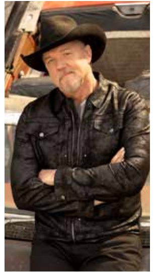
2024 Entertainer Trace Adkins.

7:00 p.m. included show RYAN BINGHAM. The singer-songwriter and guitarist has released six studio albums and one live album. Since 2018, Bingham has had a guest role in the hit TV show, "Yellowstone", as Walker, a nomadic guitar-playing ranch hand.