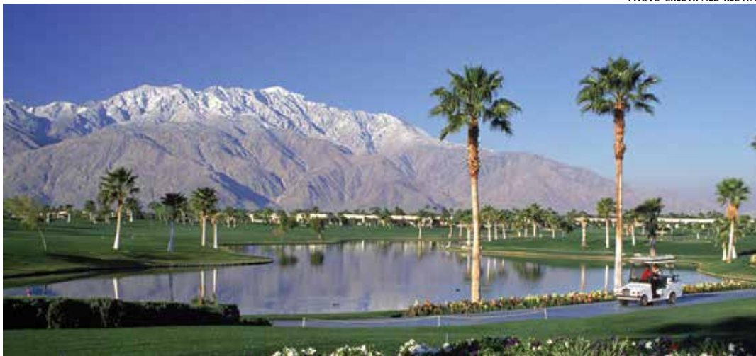
Palm Springs, California.