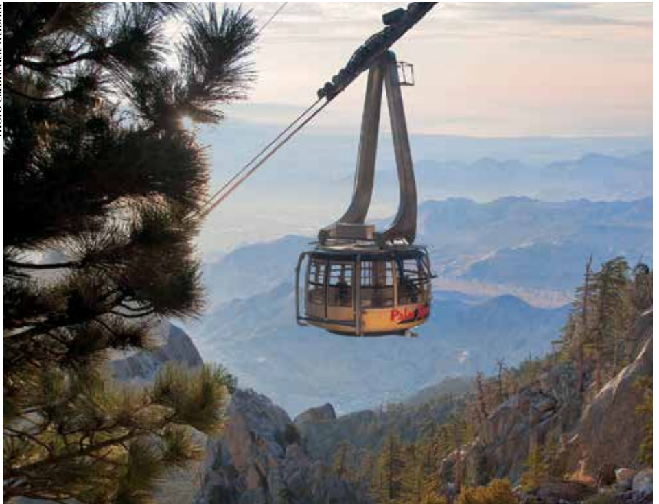
Palm Springs Aerial Tramway.