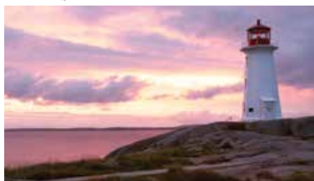
Peggy's Cove, Nova Scotia.

11 SYDNEY: Situated on one of Cape Breton's most picturesque coasts, start your day with an underground excursion beneath the Cape Breton MINERS MUSEUM. Guided by a retired coal miner of the Ocean Deeps Colliery this is also home to the famous choir of miners – The Men of the Deeps. After lunch step back in time to the year 1744 and experience the French FORTRESS OF LOUISBOURG. This National Historic Site is one of the largest reconstructions in North America.