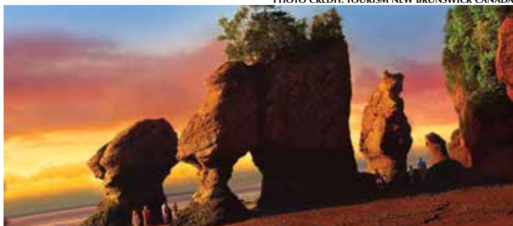
Hopewell Rocks, New Brunswick.

DEPARTURE DATES 2026 20 Days: September 14 PRICES TO BE ANNOUNCED