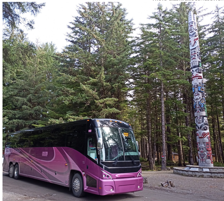
The Solstice Pole, Hiellen.

geological structures meet indigenous culture. Break for an included LUNCH before your motorcoach carries on to Prince Rupert, the gateway to BC’s beautiful north coast. Settle in at the friendly Inn on the Harbour .