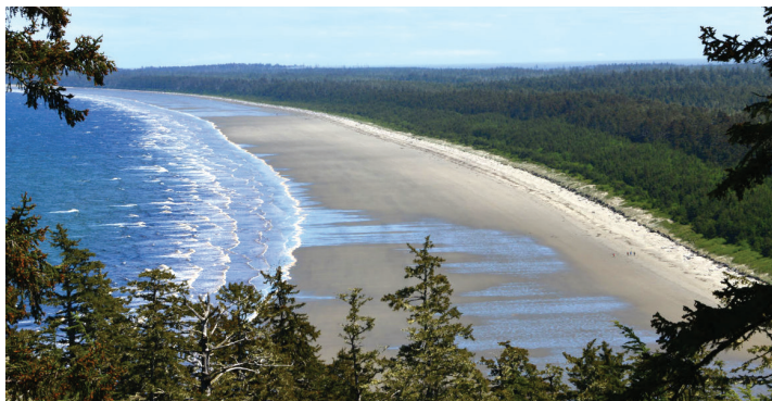
Haida Gwaii beach.