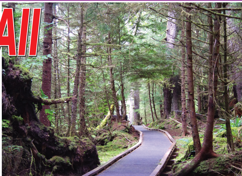
Tow Hill walking trail.