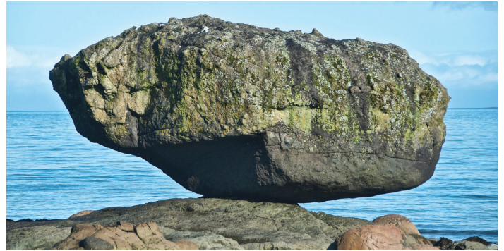
Balance Rock at Skidegate.