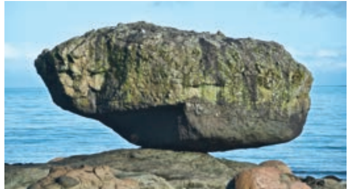
Balance Rock at Skidegate.

10 TERRACE to PRINCE GEORGE: Retrace your route through north-central British Columbia to Prince George for overnight at Hyatt Place .