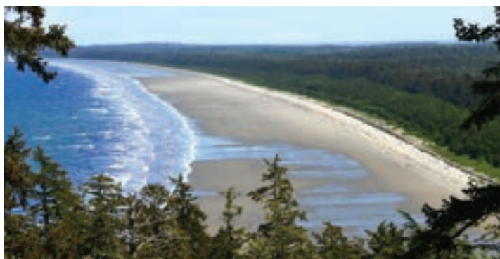
Haida Gwaii beach.