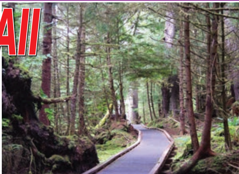
Tow Hill walking trail.