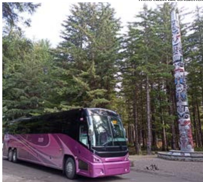
The Solstice Pole, Hiellen.

geological structures meet indigenous culture. Break for an included LUNCH before your motorcoach carries on to Prince Rupert, the gateway to BC’s beautiful north coast. Settle in at the friendly Inn on the Harbour .