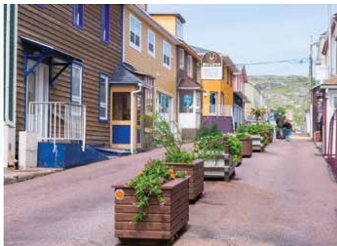
Downtown St. Pierre, France.

St. Pierre & Miquelon Official Currency: EURO symbol € Currency accepted: Canadian cash, debit and major credit cards at most businesses Cash transactions: change in Euros ATM: convenient to hotel ACTIVITY LEVEL: Will require occasional walking on rugged and uneven terrain, travellers should therefore be in reasonably good health.