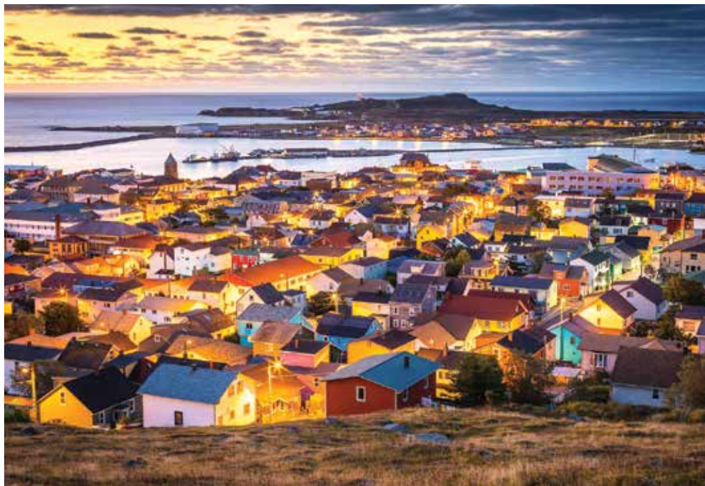
St. Pierre, France.