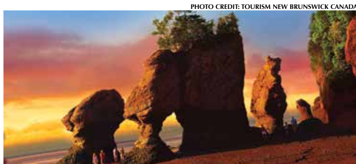
Hopewell Rocks, New Brunswick.

16 SAINT JOHN to FREDERICTON: Come witness the REVERSING RAPIDS where twice daily, the Bay of Fundy's highest tides pour, push and rise forcing the Saint John River to reverse its direction. Travel to ST. ANDREWS BY THE SEA, Canada's first seaside resort. While at KING'S LANDING, see what life was like in New Brunswick 200 years ago. No time like the present to discover the past! Overnight in the capital city of Fredericton.