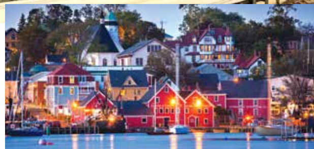
Lunenburg, Nova Scotia.