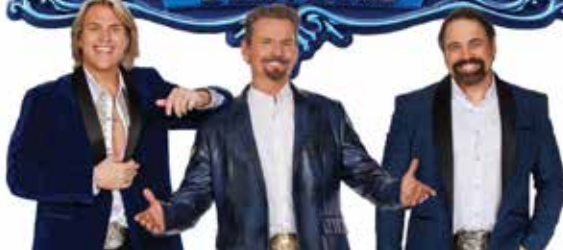
The Texas Tenors, 2024 past entertainers.