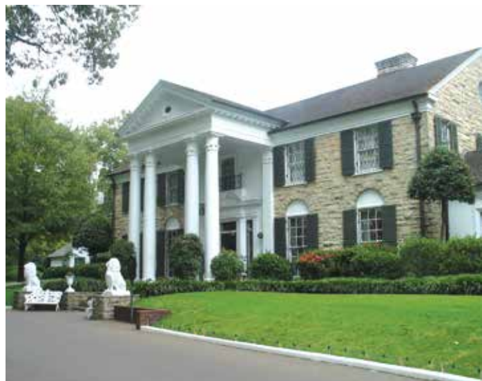
Graceland, Memphis, Tennessee.