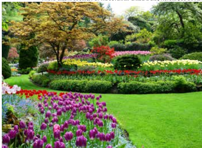
Early blossoms in Victoria.