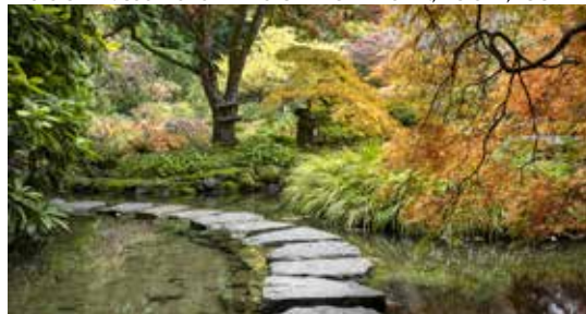
Butchart Gardens Autumn Splendour.