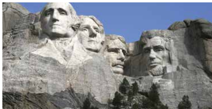
Mount Rushmore National Memorial.