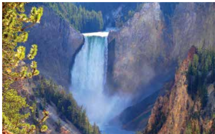
Grand Canyon Falls, Yellowstone National Park.

6 RAPID CITY to BLACK HILLS to RAPID CITY: Thursday. This morning travel through the BLACK HILLS NATIONAL FOREST to visit two of the world's largest mountain carvings. Ride the Black Hills Central Railroad 1880 TRAIN, an authentically restored steam engine that transports you back in time, on your way to the MOUNT RUSHMORE NATIONAL MEMORIAL. Afterwards, travel by motorcoach to the CRAZY HORSE MEMORIAL and return to Rapid City for overnight.