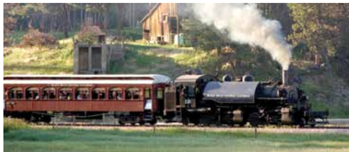
Ride the 1880 train.