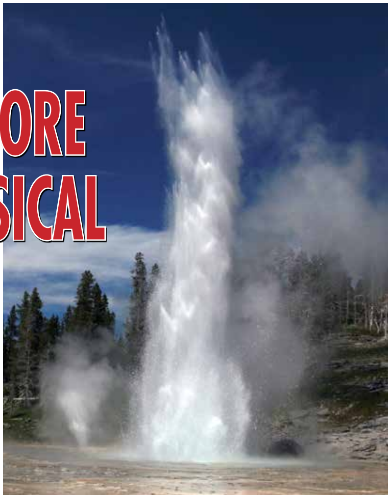
Grand Geyser and Vent Geyser in Yellowstone National Park.