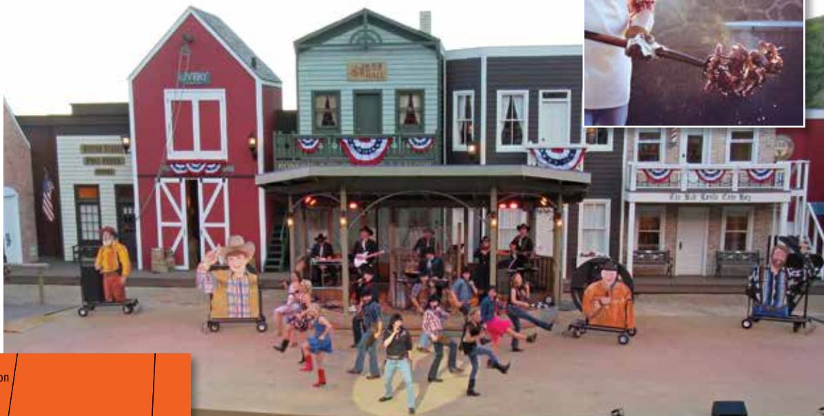
Medora Musical, Medora, North Dakota.